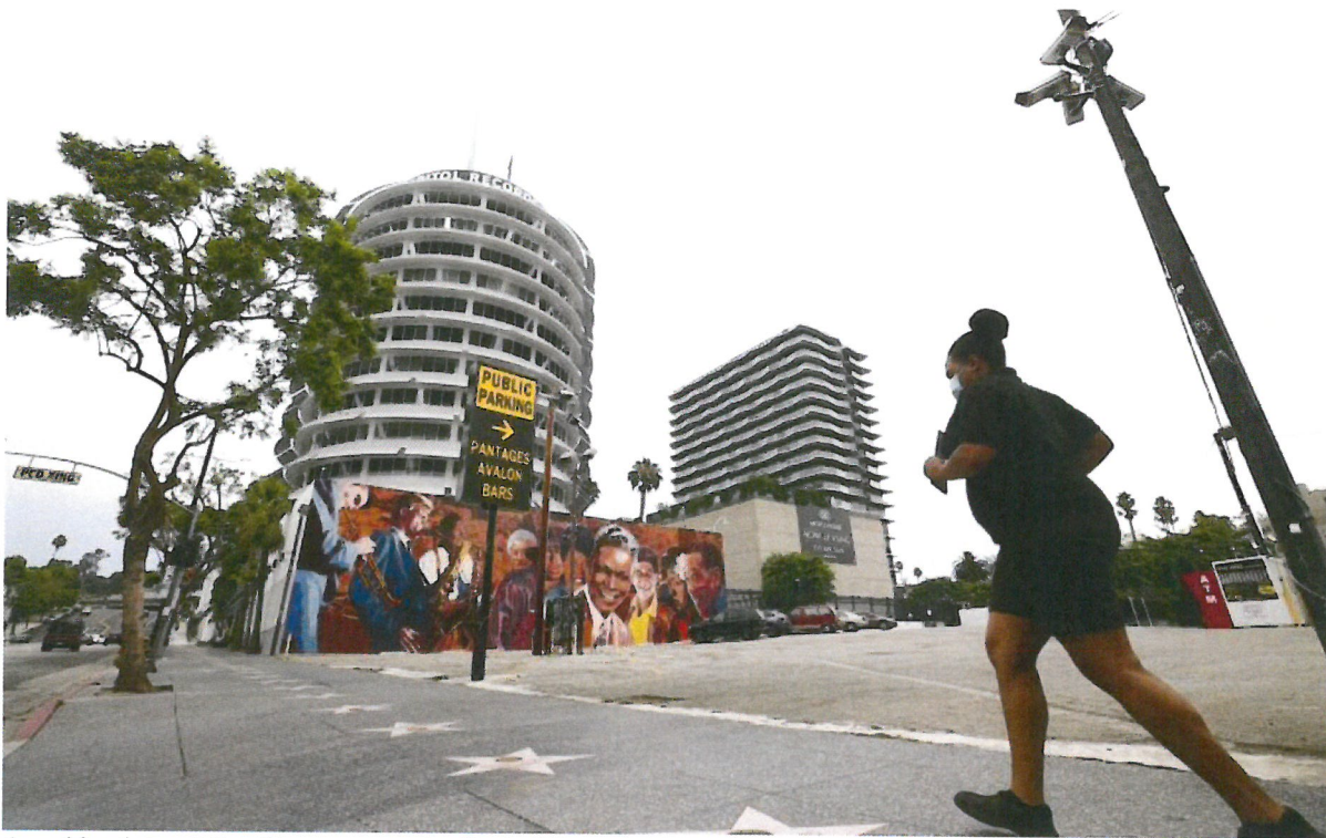
A parking lot on Vine Street next to the Capitol Records Tower is the proposed site for the Hollywood Center project.

https://www.latimes.com/california/story/2020-07-22/evidence-mounts-earthquake-fault-underlies-giant-hollywood-proposed-development